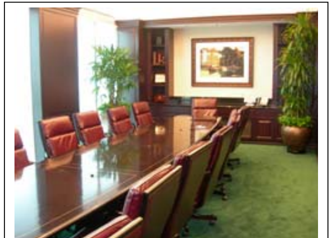
CONFERENCE ROOM NEAR RECEPTION AREA