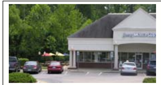
Jersey Mike's features an outdoor seating area