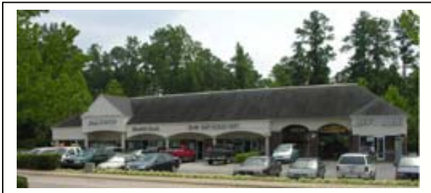
Preston Center includes Jersey Mike's, Electric Beach, Dry Clean City and Jiffy Lube