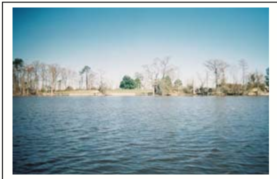
View of Peninsula – Perquimans River