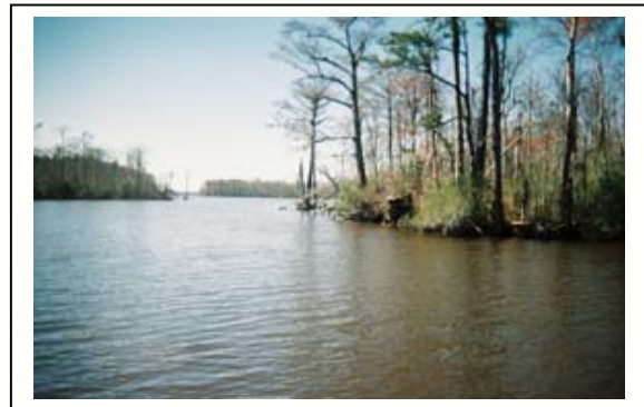
View of Sutton's Creek